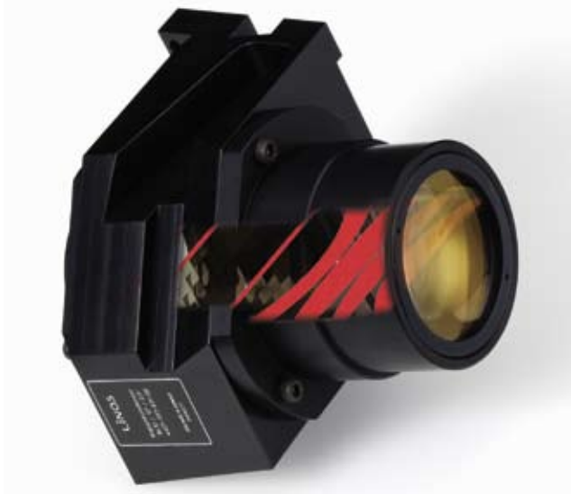
LINOS' solution for optimised (high fluence and homogeneous) UV illumination of an DLP device (integrated lens array)