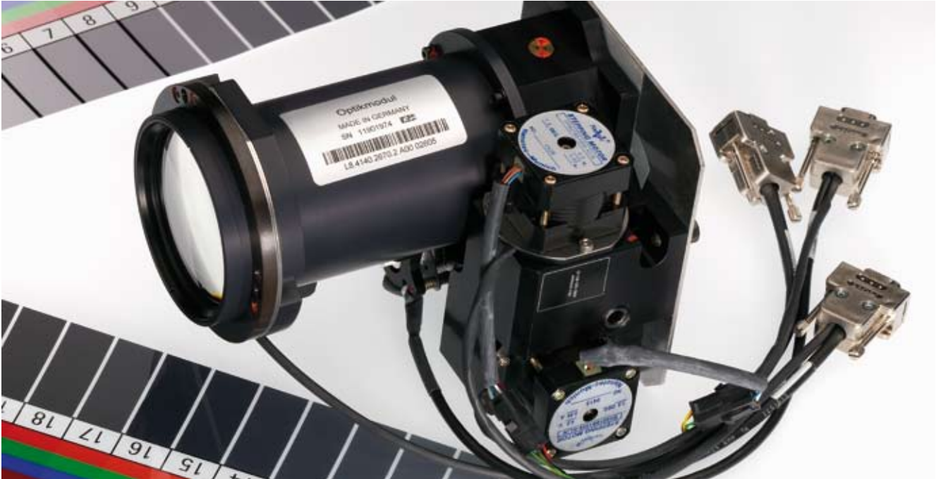
LINOS' solution for adaptable imaging (including motorized zoom lens and image stepper) for various printing plate formats.