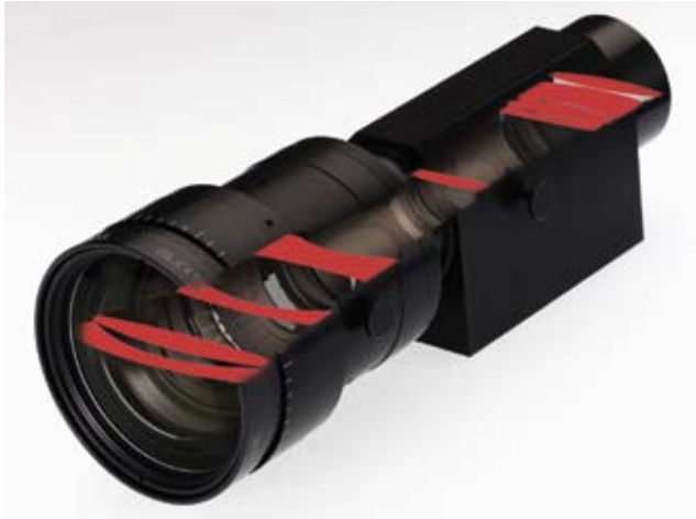
LINOS' solution for large format high speed imaging (precisely adjustable aspect ratio)

Solutions according to customer requirements: advanced optics, optomechanics, fully integrated assemblies